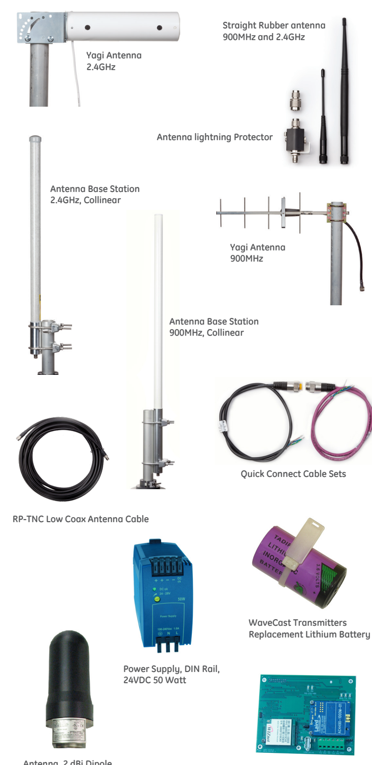
Antenna, 2 dBi Dipole, Division 2